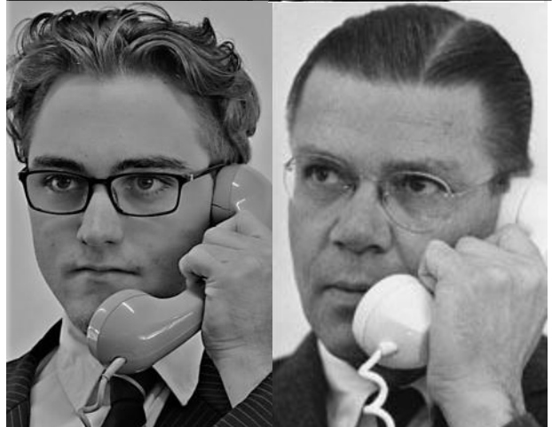
Robert S. McNamara