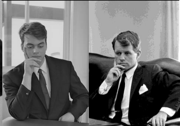
Bobby - Robert F. Kennedy